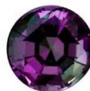
Color in Incandescent Light