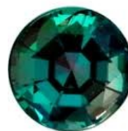
Color in Daylight

American Opal Society Business Expo Center, 1960 S. Anaheim Way, Anaheim 92805 Adults – $5, Students and children under age 15 are free; Free parking Hours: Sat 10 am – 5 pm, Sun 10 am – 4 pm Contact: (714) 501-9959, aos.editor02@gmail.com Website: http://opalsociety.org Show Flyer: 2020Flyer.jpg