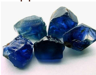
DIFFERENT COLORS OF BLUE SAPPHIRE