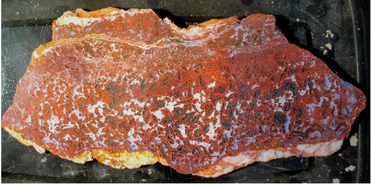
Figure 2 – Seam jasp agate with hematite from South Cady mine dump

(email: Andrew.bloxom@gmail.com , Field Trip Chairperson)