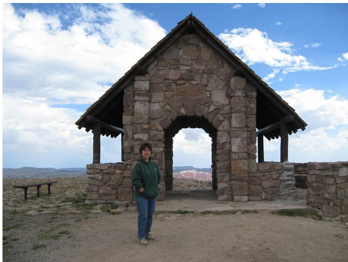
Brian Head Peak