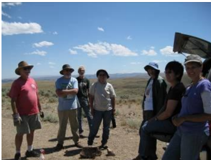
Taking a break