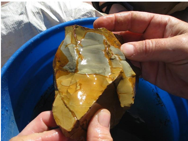
Picture jasper from the Wild