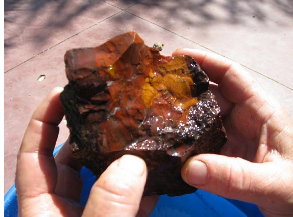
Jasper from Holt Canyon