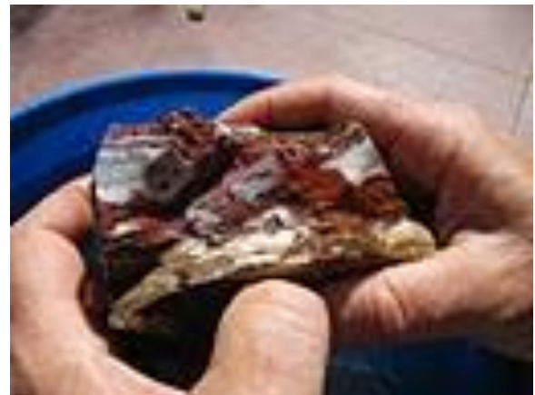
Little Panoche Rd jasper