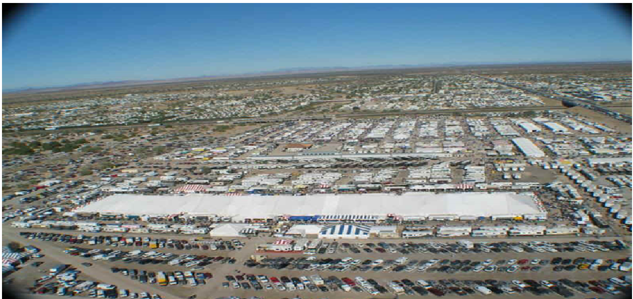
Looking north toward Tyson Wells Sell-A-Rama and “downtown” Quartzsite