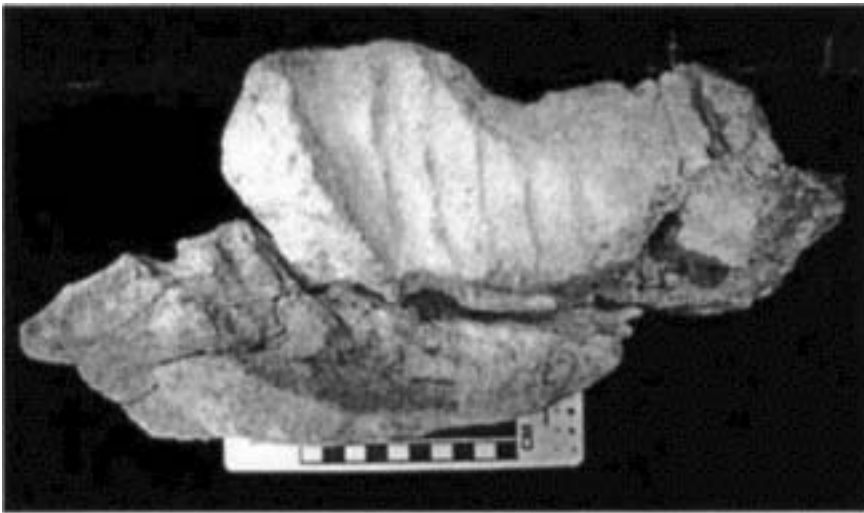
Figure 3. View of mandible fragment. Florissant Fossil Beds National Monument specimen FLFO-2392.

The fossil material is important for several reasons: (1) it provides documentation of the presence of mammoth fossils at Florissant; (2) this discovery at an elevation of 8,400 feet (2,560 meters) is a relatively high elevation for Columbian mammoths; and (3) the tooth was radiocarbon dated to be at least 50,000 years old. Even though this tooth is older than the reliable range for radiocarbon dating, it shows that mammoths lived at high elevations before the last glacial maximum, about 18,000 radiocarbon years ago.