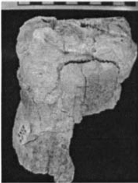
Figure 1. View of the partial molar tooth of a Columbian mammoth found near Florissant Fossil Beds National Monument's visitor center. Florissant Fossil Beds National Monument specimen FLFO-2392.

The Florissant mammoth was discovered in 1994 in a road cut near the visitor center when an intern noticed small fragments of bone material scattered around the entrance of a rodent burrow. While many fossil discoveries are the result of organized scientific work, this discovery was by sheer chance.